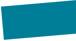
Table 4: 2017 student contribution amounts